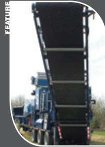
Oscillating Stacking Conveyor Pivots 40 Degrees