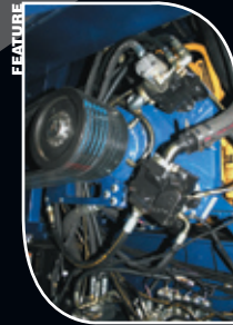
HPTO Wet Clutch