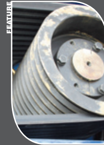
10 Groove Belt Drive System