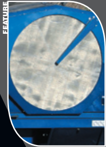
Self Cleaning Air Intake System