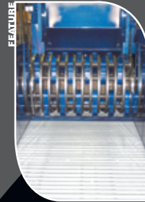
12,100 lb. (5,488.47kg) Hammermill