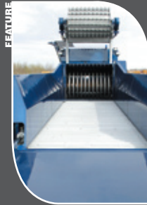
Self Governing Apron and Feed Roller Feed Large Hammermill