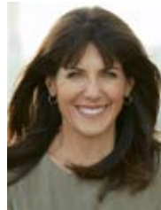
JEAN CHATZKY TODAY Show