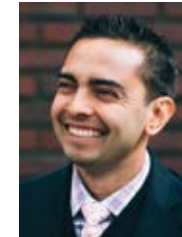
PAT FLYNN Smart Passive Income