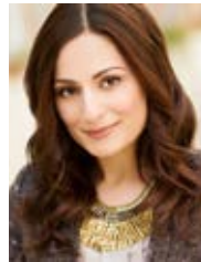
FARNOOSH TORABI Farnoosh.tv